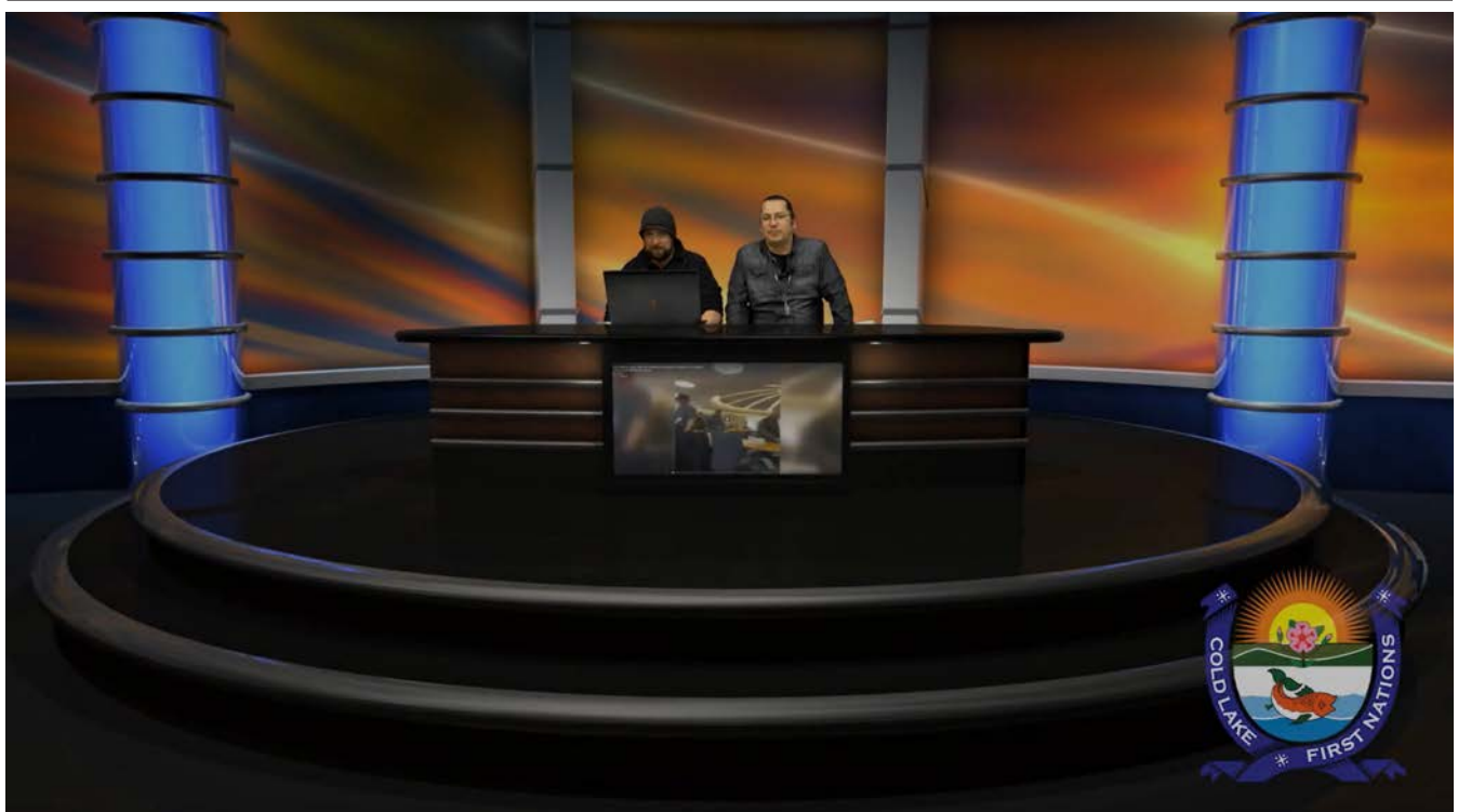
- Screen capture from the latest community updates feature from youtube.com/coldlakefirstnations .

a small desk in front of a large green cloth. This technology is featured in our new Community Updates section of our YouTube page. Using this tech allows us to communicate with community members in an eye catching and interesting modern method, similar to what most professional "youtubers" do.