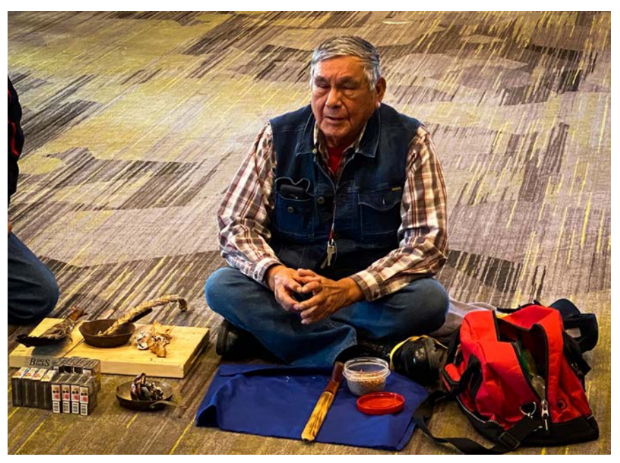
~ An Elder prepares for the pipe ceremony.

The Saddle Lake Lateral Loop NPS 20 pipeline project is an approximate 20km long new NPS20 transmission pipeline. The purpose of the Project is to provide transportation and metering facilities to transport and measure sweet natural gas to meet a customer's increased delivery transportation service requirement. The Project includes approximately 20 km of 20-inch (508 mm) diameter pipeline, which includes a 1,084m HDD crossing of the Beaver River,