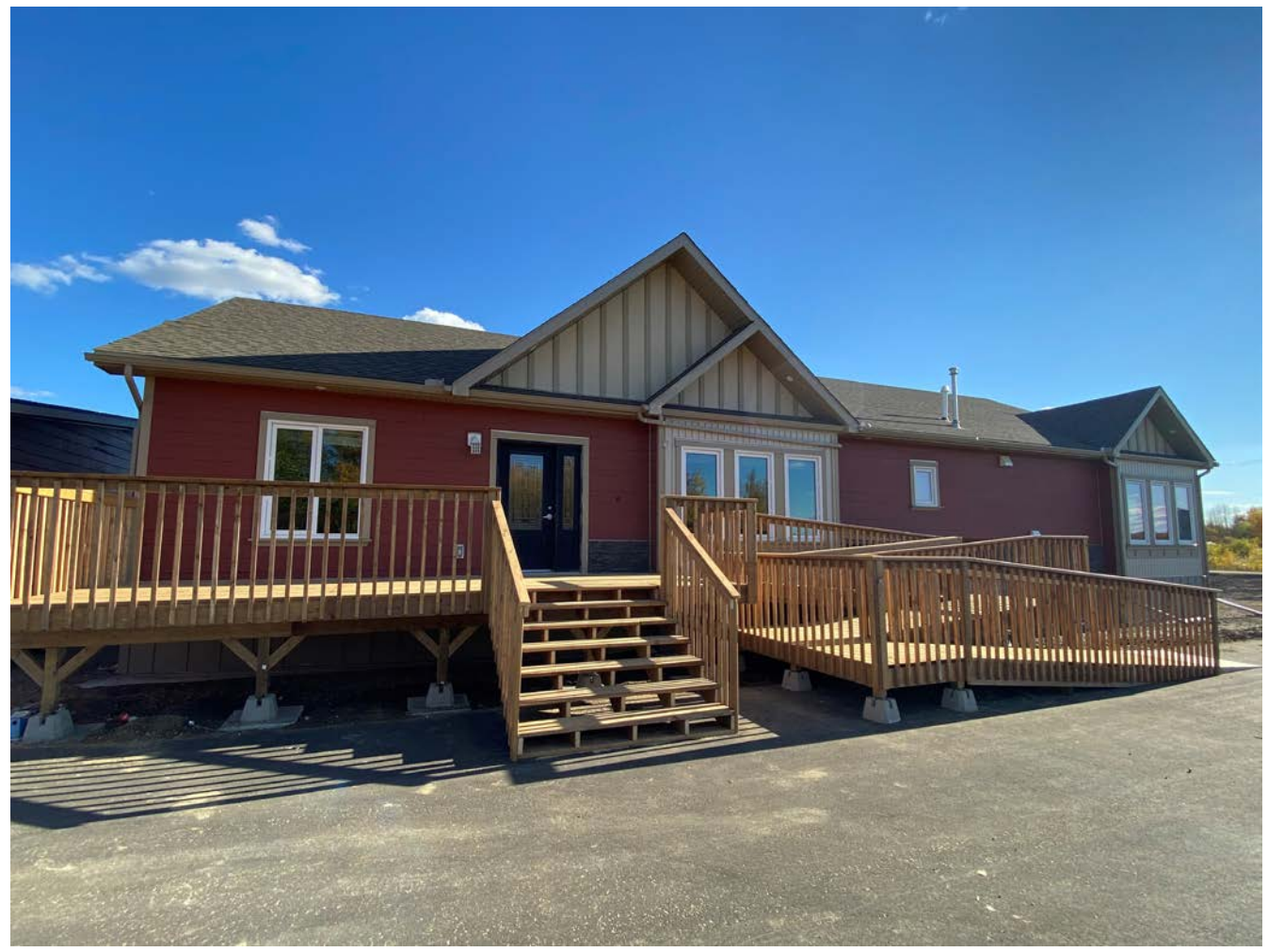
~ The front of new Mental Wellness Centre.

Mental wellness is and always has been a serious concern for the people of Cold Lake First Nations. the past year, COVID-19 In has caused skyrocketing numbers of depression and suicide rates nationally and globally. This summer construction started began and thankfully, now Cold Lake First Nation's new Mental Wellness Centre is complete and ready to be opened.