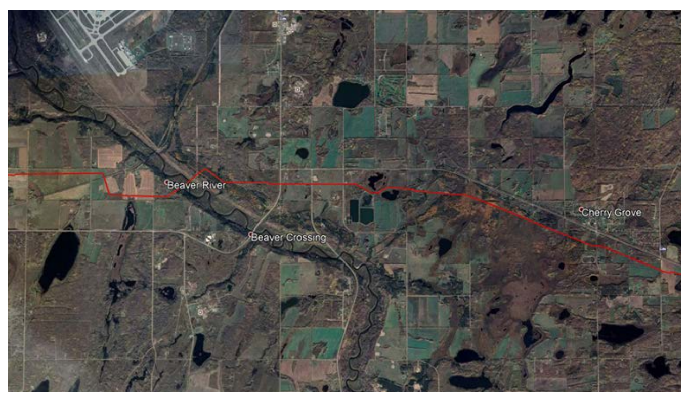
~ Project map of Saddle Lake Lateral Loop Pipeline.