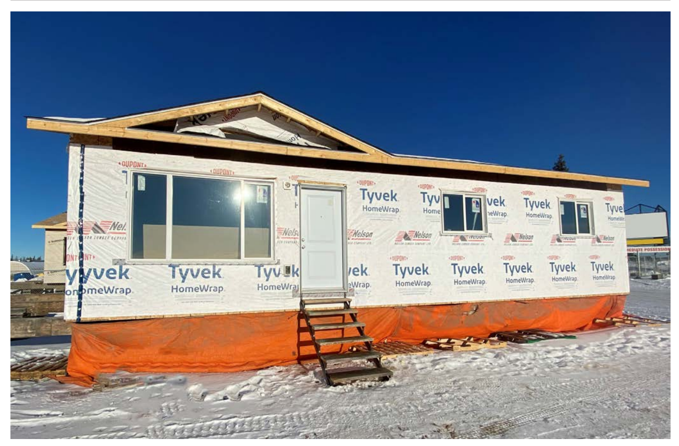
~ The first of several almost complete homes (top) and an ariel view of the construction process (below).