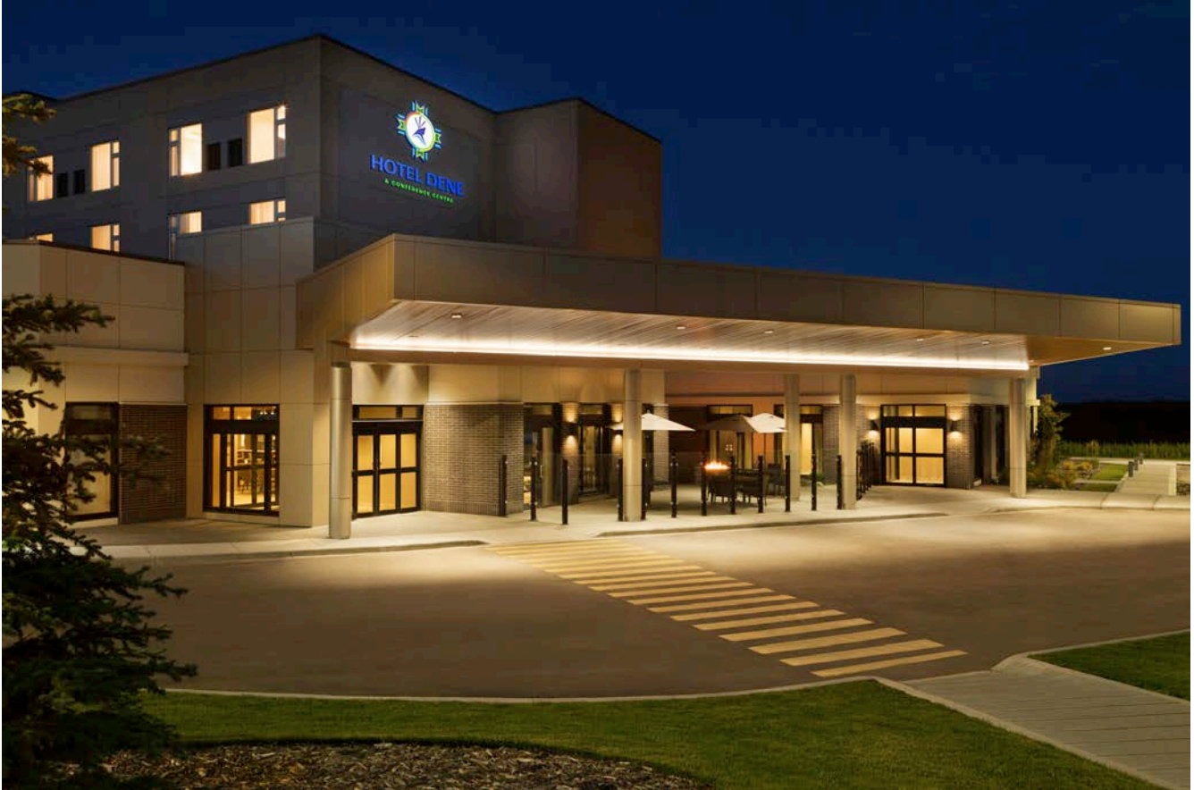
~ The former Courtyard Cold Lake by Marriott in Cold Lake, Alberta is now the Hotel Dene & Conference Centre.

Cold Lake First Nation's closed out the year with the long the long awaited rebranding of the new Hotel Dene & Conference Centre (formerly Courtyard by Marriott). The new independence of the hotel will allow for greater connectivity with Casino Dene and provide a win for local tourism.