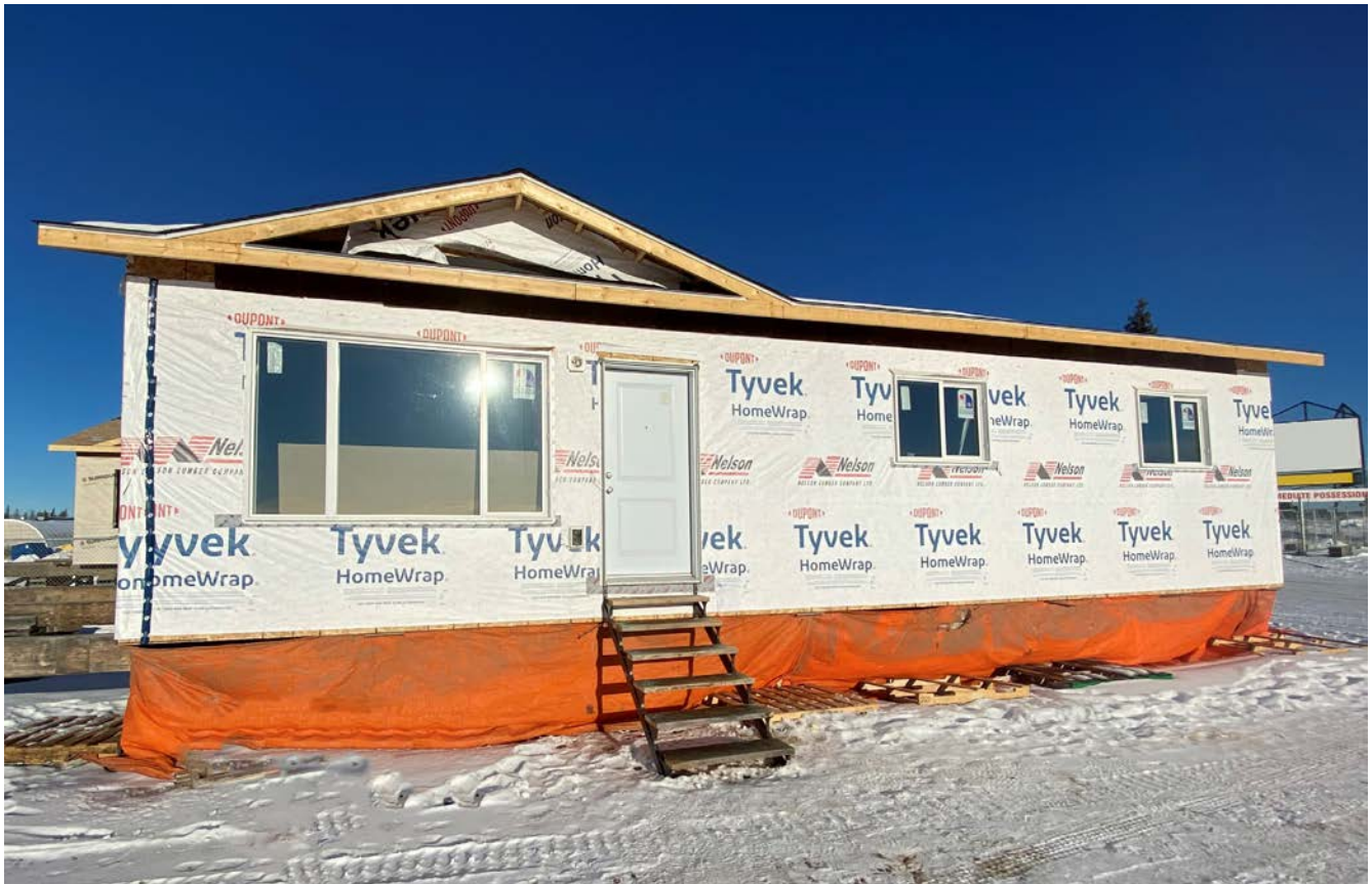
~ The first of several almost complete homes (top) and an ariel view of the construction process (below).