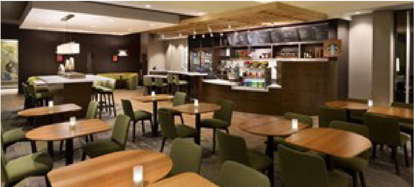
~ The view of the yet to be revealed new cafe inside the new Hotel Dene and Conference Centre.