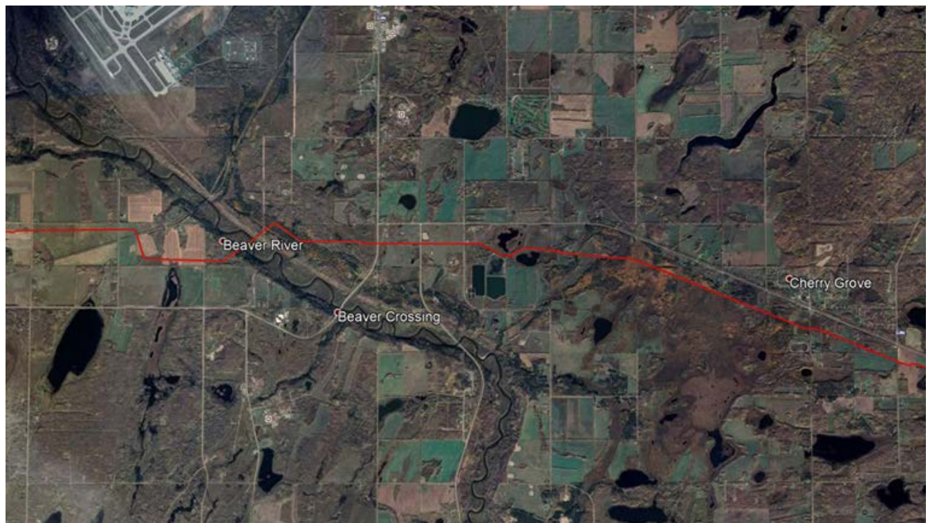
~ Project map of Saddle Lake Lateral Loop Pipeline.