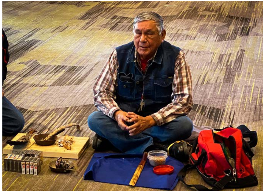
~ An Elder prepares for the pipe ceremony.

October with a traditional pipe ceremony and will continue with substantial completion prior to April 1, 2021 and final clean-up scheduled for summer 2021.