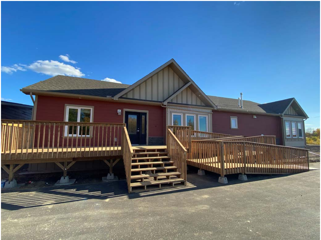
~ The front of new Mental Wellness Centre.

Mental wellness is and always has been a serious concern for the people of Cold Lake First Nations. In the past year, COVID-19 has caused skyrocketing numbers of depression and suicide rates nationally and globally. This summer construction started began and now thankfully, Cold Lake First Nation's new Mental Wellness Centre is complete and ready to be opened.