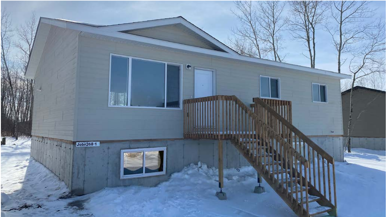
~ The first of several homes from the Cenovus Housing initiative sits at its permanent address (TOP). Drone view of the second home as it makes its way to the Nation. (BOTTOM)