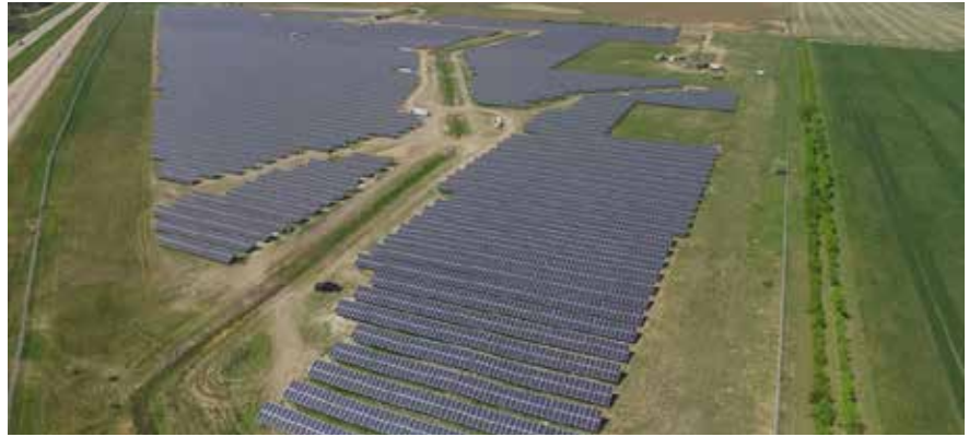
- Aerial view of Elemental's Brooks, AB Solar Project