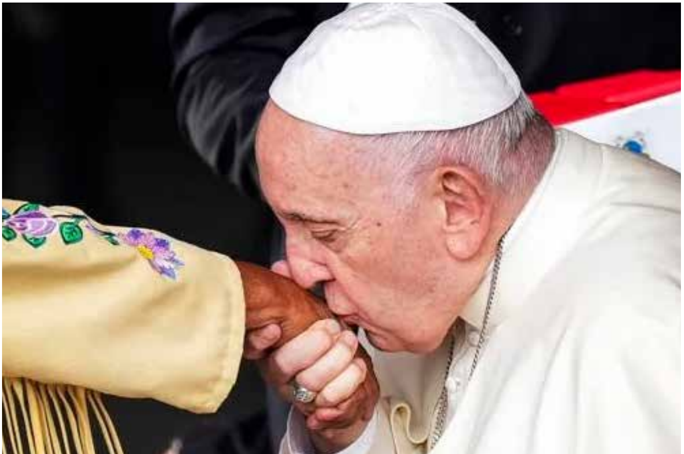
~ Pope Francis kisses the hand of one of the attendees of his apology tour.

It was the apology heard around the world as Pope Francis apologized in person for the Catholic Church's role in residential schools.