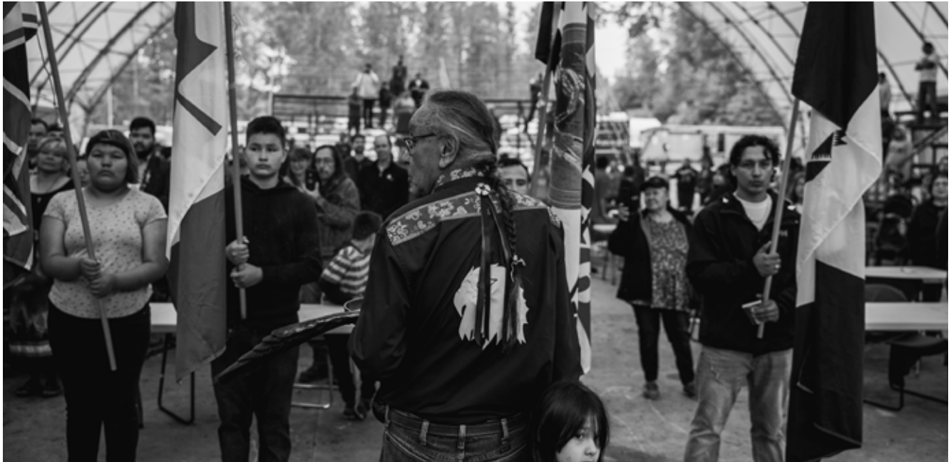
- Looking down the crowd at the opening ceremonies of Treaty Days 2022.

The opening ceremonies were a broadly unifying spectacle as the thunderous sounds of Dene drums echoed across the grounds.