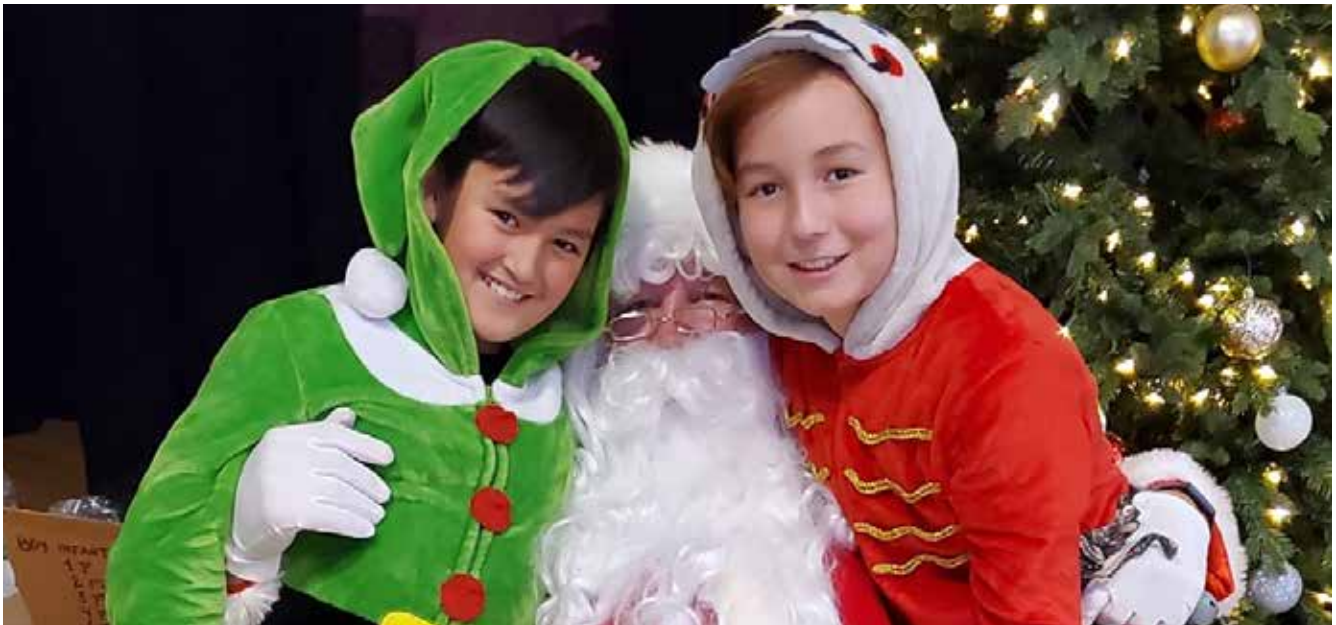
- Children pose with Santa at the 2019 Urban Member’s Dinner

Our Community Christmas Dinners are all back, December 15th at the