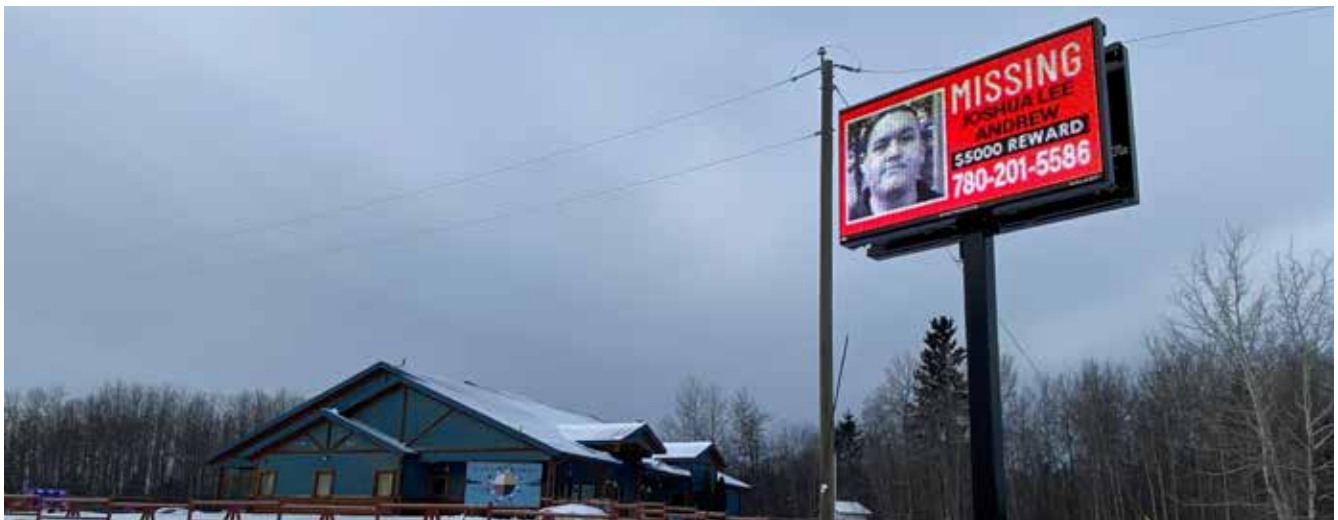
- The sign at the English Bay Center, displaying a very important message about a missing community member.

High Tech digital signs have been erected next to the Administration Building and the English Bay Centre on CLFNS.