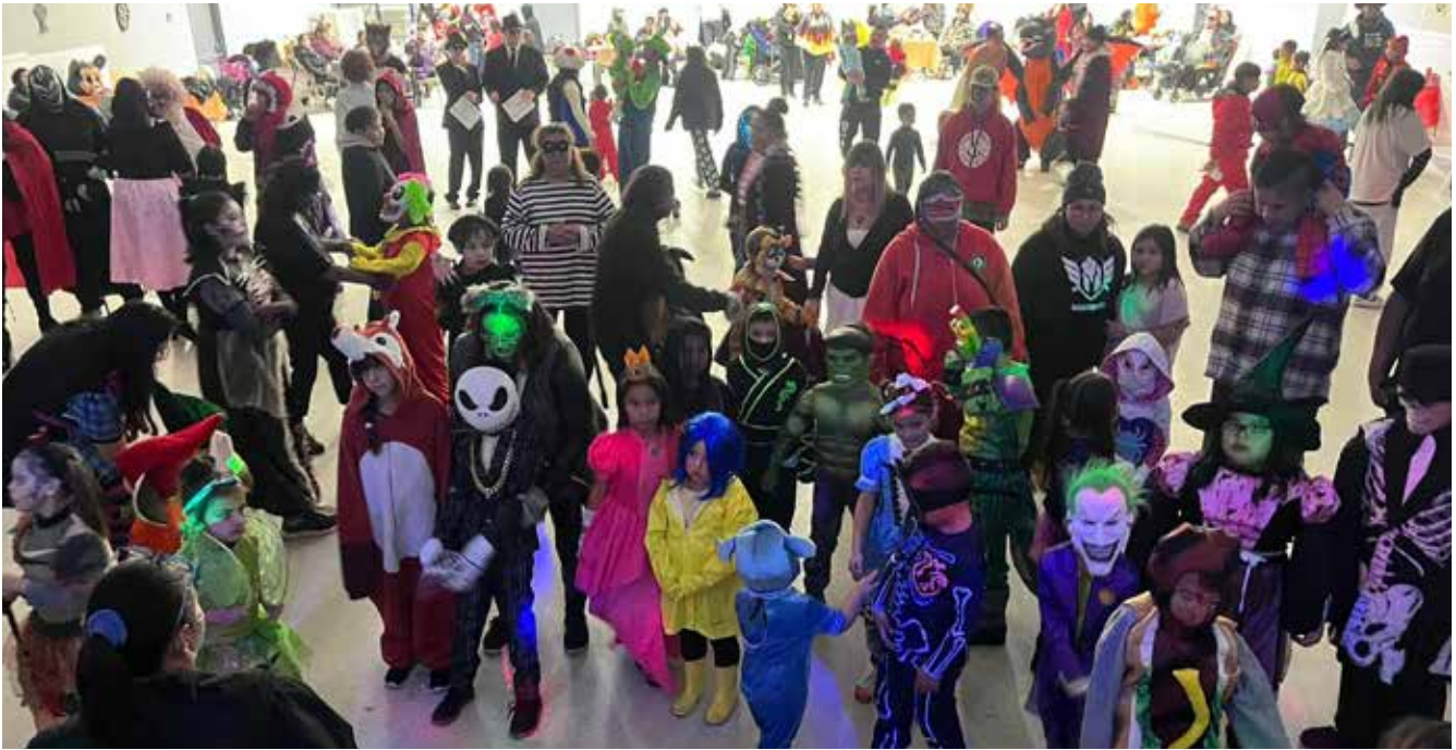
~ The huge crowd of spooks and ghouls at the CLFNS Halloween Dance.

sweet-scented candles. The glow from these creations illuminated homes, casting a cozy yet eerie ambience throughout the night. It's like Cold Lake First Nations had its very own army of ghostbusters, warding off the darkness with the power of candles.