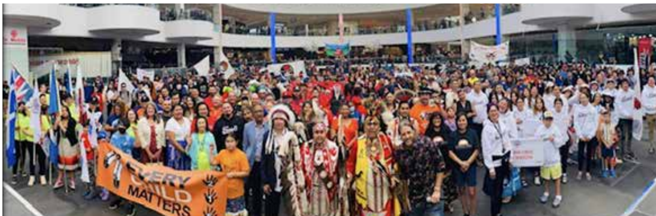
~ The participants in the Alberta Indigenous Games in Edmonton, Ab.