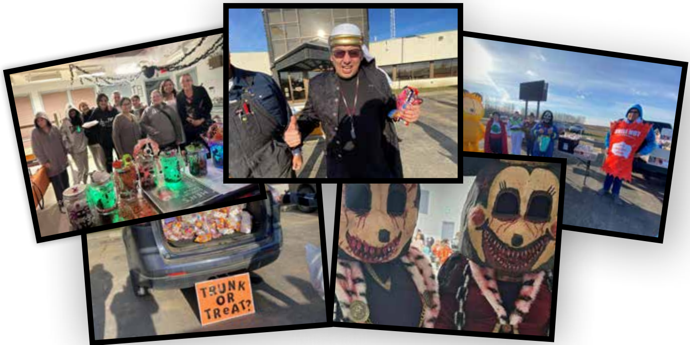
~ Spooks and goblins partake in the Halloween festivities at CLFNS.

The Annual Halloween Dance kicked off the festivities with a bang, or should we say, a howl! The community center was transformed into a bewitching ballroom where monsters and mummies, princesses and pirates, and creatures of all kinds danced the night away. With live music that would wake the dead, the band had everyone grooving like zombies,