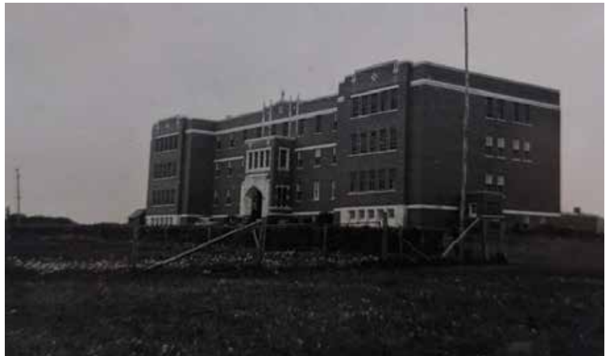
~ The exterior of Blue Quills, between 1938-1949.

It is important to understand that only Survivors themselves can make this decision. Because the testimonies are deeply personal and confidential, family members cannot opt-in on behalf of a loved one who has passed away. This makes it especially important for Survivors to be aware of their options while there is still time.