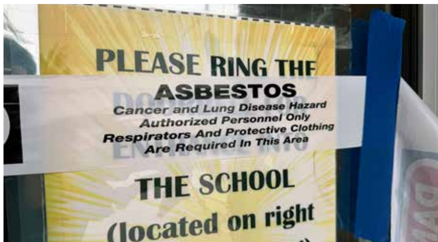
~ The ominous warning sign that sits on the door of the school.

Remediation work is now underway at John N. A. Janvier School on the Nation as efforts continue to ensure the building is safe for students and staff before they are expected to return to the school.