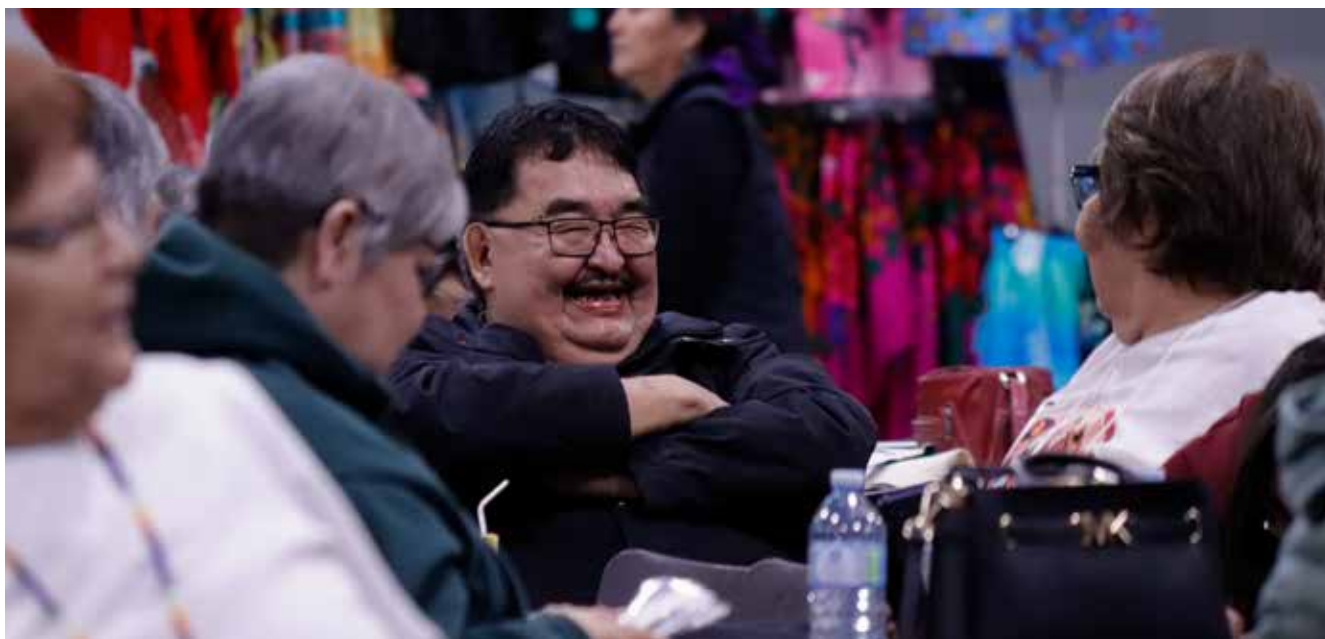
~ Presenters and guests sharing a moment of joy at the Dene Language Revitalization Conference.

How learning personal finance skills can help members manage money, plan ahead, and make informed financial decisions.