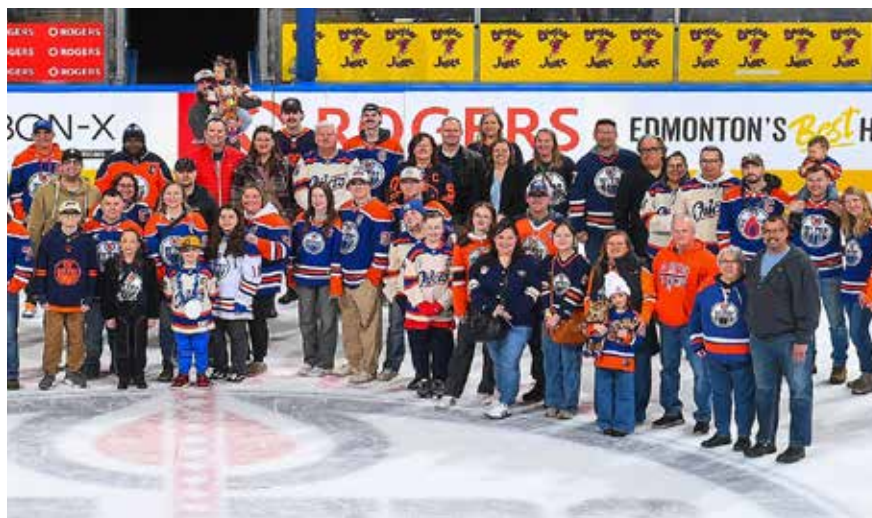
~ Members of CLFNS and the surrounding community hit the ice during the Edmonton Oilers game.

“Gatherings like this remind us of the strength we carry when we come together with pride, with friendship, and with a shared